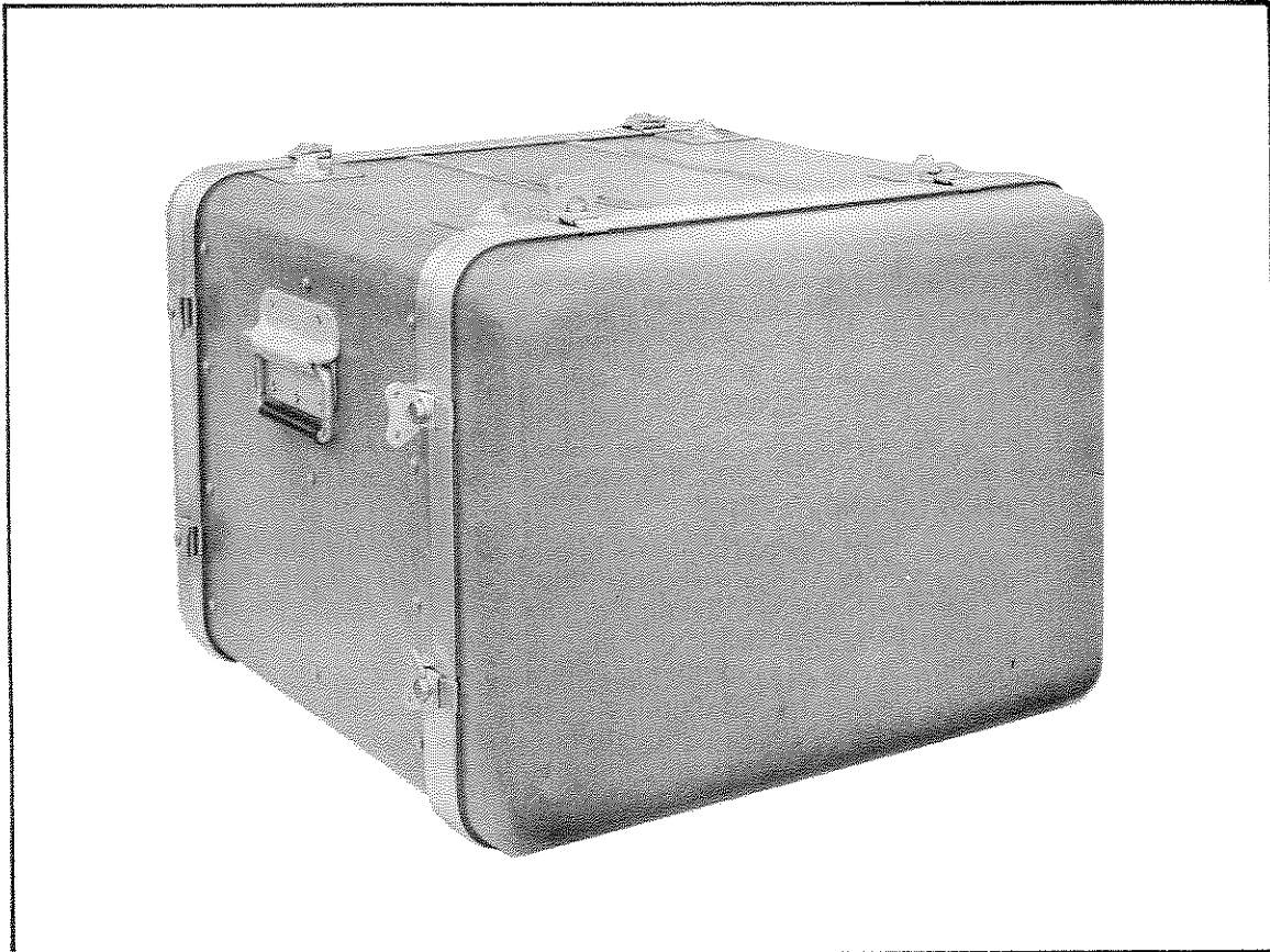
Front View, Model TOC

The TMC Model TOC, Transit/Operating Case, is a sturdy fiberglass reinforced carrying case designed for field or base station use.