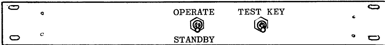
Figure 1. Control Panel, AX560A, Front Panel View

Control Panel, AX560 A (figure 1) provides standby/operate power control and a test key function for an associated transmitter system.